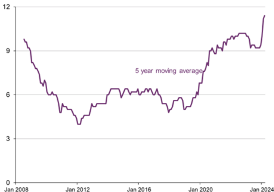
Figure 3a: High consequence earthworks failures

Graphs showing annual potentially high consequence earthworks failures and annual derailment rate. Potentially high consequence failures are those scoring 50 and above based on the CIV/185 standard.