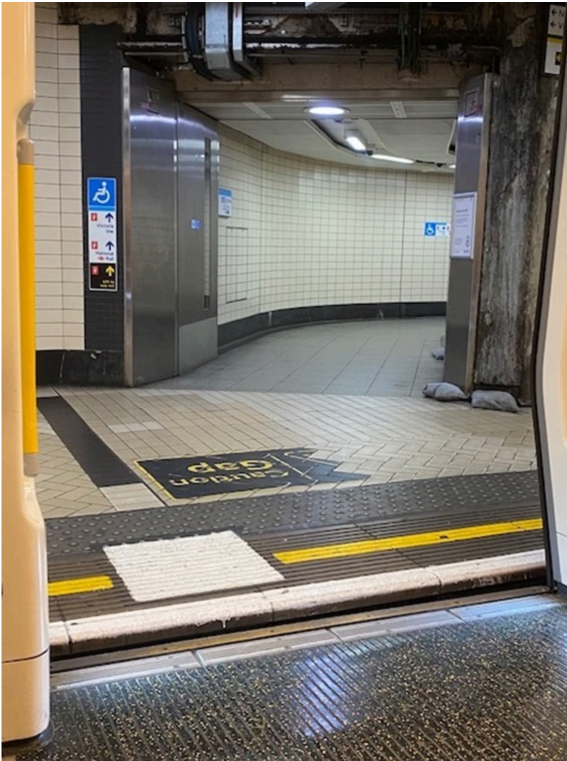
Photo: Platform Train Interface on the District Line