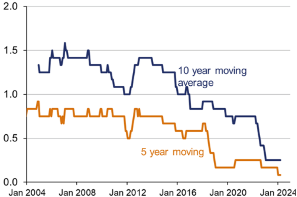
Figure 3b: Annual derailment rates