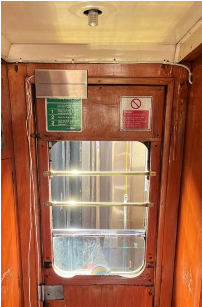
Photo: Vintage trains fitment of a central locked door bolt

We have assessed the change management arrangements of operators introducing new trains. Our expectation is that operators will ensure health and safety by design and take the opportunity to improve risk control with technology, such as the extending steps on Stadler trains, which in most situations eliminates the gap at doorways between train and platform. Instead, we have seen operators remove reasonably practicable engineering controls, choosing instead risk controls reliant on people, for example the switching-off of speed supervision systems on existing fleets or introduction of replacement fleets without compatible equipment. This will be the subject of further investigation.