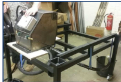
Prototype underframe system