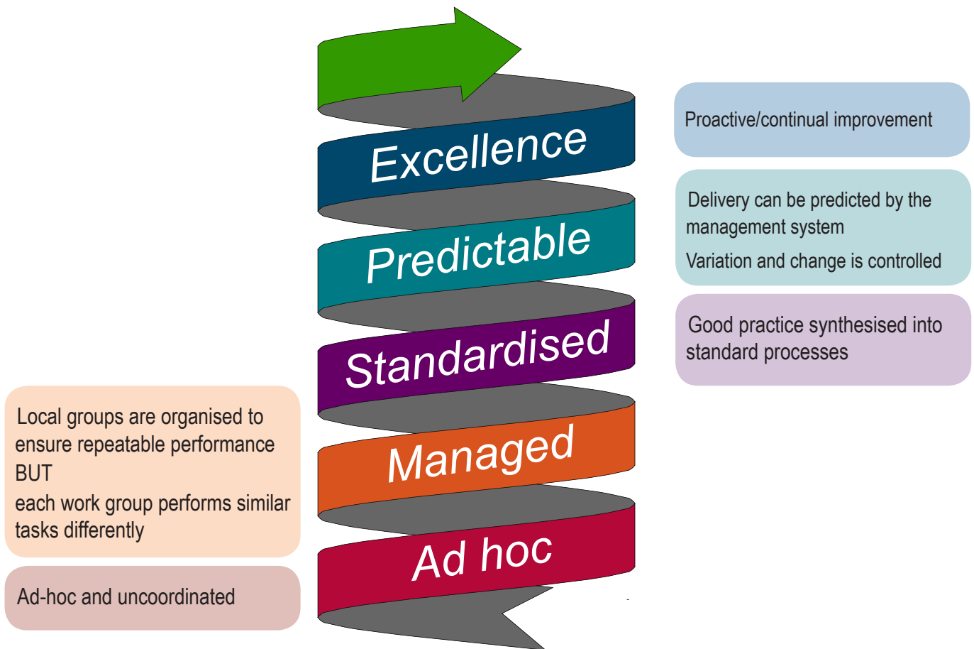
Figure 3 RM 3 maturity levels