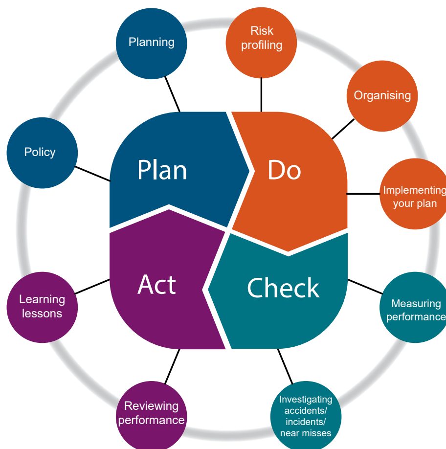
Figure 1 The Plan, Do, Check Act cycle (HSG 65 2013)